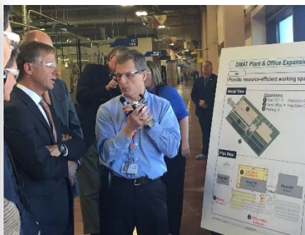
Governor Haslam on tour of DENSO