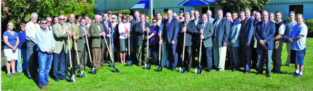
Groundbreaking at Midlab.

On September 24, 2014, local and State officials helped Midlab break ground on a $1.2 million expansion that will create 4 new jobs. Their expanded building will house a new commercial digital label press and finisher.