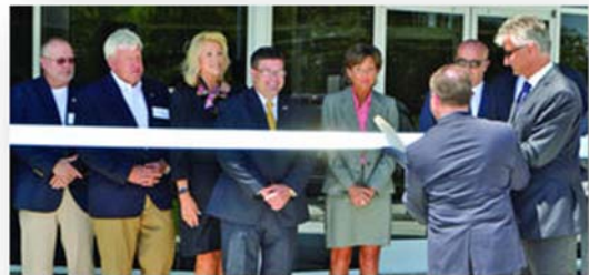
Ribbon Cutting at Adler Pelzer.