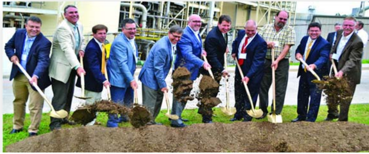
Federal, State, and Local Official join Resolute Forest Products on breaking ground for the Kraft Mill expansion project.

Staff continued close relations with the Tennessee Department of Economic Development (ECD), TVA Economic Development, and regional economic development organizations. Staff met with site consultants, developers, and individual companies to promote McMinn County, and our available industrial properties. Staff attended the following conferences and events where industrial site location consultants and/or companies were present to network, strengthen relationships, and to further promote McMinn County. These events also offered professional development opportunities to help strengthen McMinn County's competitiveness.